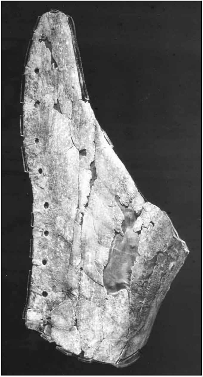
Figure 4. Reconstructed right armlet. DgRw-4:3012

We cannot rule out that these armlets were part of a ceremonial costume. The Marpole piece, however, has a fairly tough 3mm thickness. It could have served the purpose of body armour if, for example, it was placed between two layers of elk hide—the preferred upper body armour in the early 19th century.