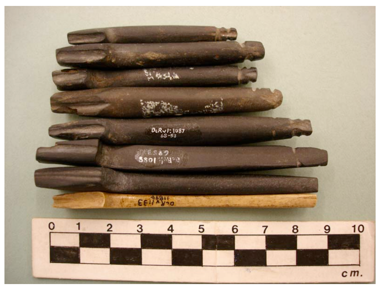
Figure 4. Examples of shanks from Pedder Bay. Ventral view. Bottom to top DeRv1:33; 1086; 1088; 1087; 501; 352; 235; 730.