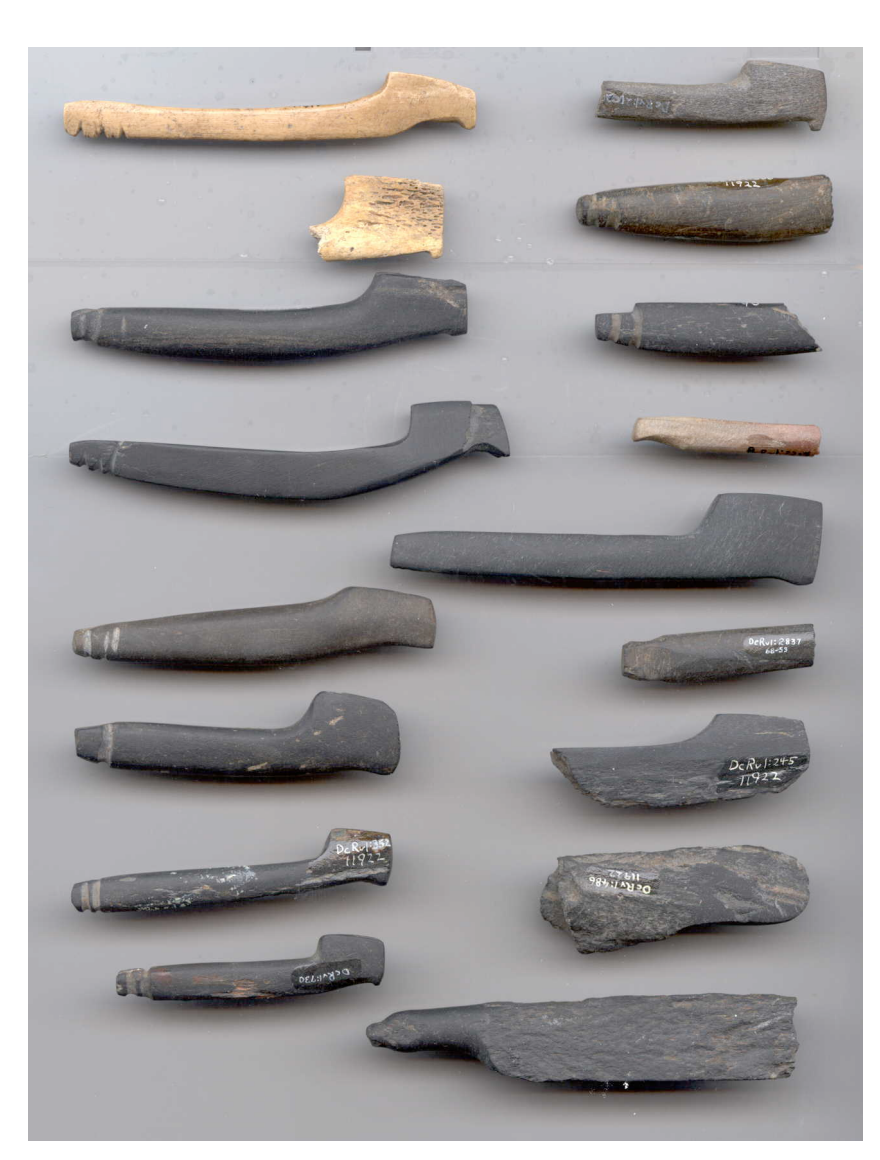
Figure 5. Fish Hook Shanks from DcRv-1, Pedder Bay. Right Row from top to bottom: DcRv-1:102; 508; 1090; 2219; 1086; 2837; 245; 486; 2103. Left Row from top to bottom: DcRv-1:33; 574; 1087; 1088; 501; 235; 352; 730.