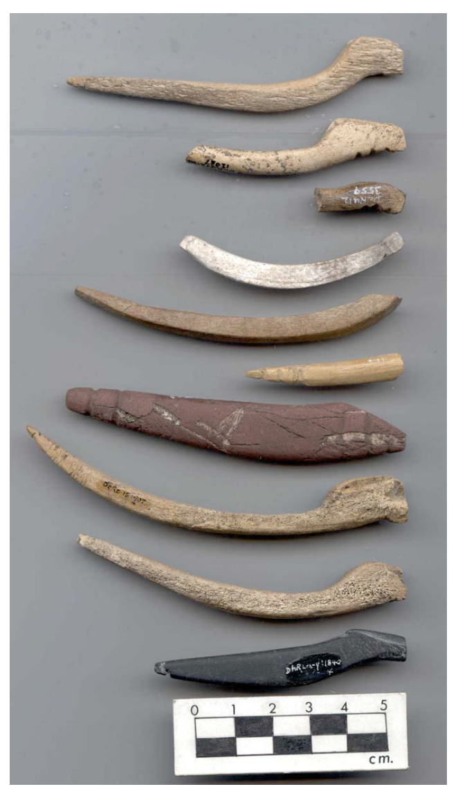
Figure 7. Fish hook shanks from Esquimalt Harbour area and Cadboro Bay. Top to Bottom: DcRu-12:2914; DcRu-12:40; DcRu-12:3559; DcRu-78:22; DcRu-2:407; DcRu-2:441; DcRt-9:412; DcRt-15:907; DcRt-15:514.