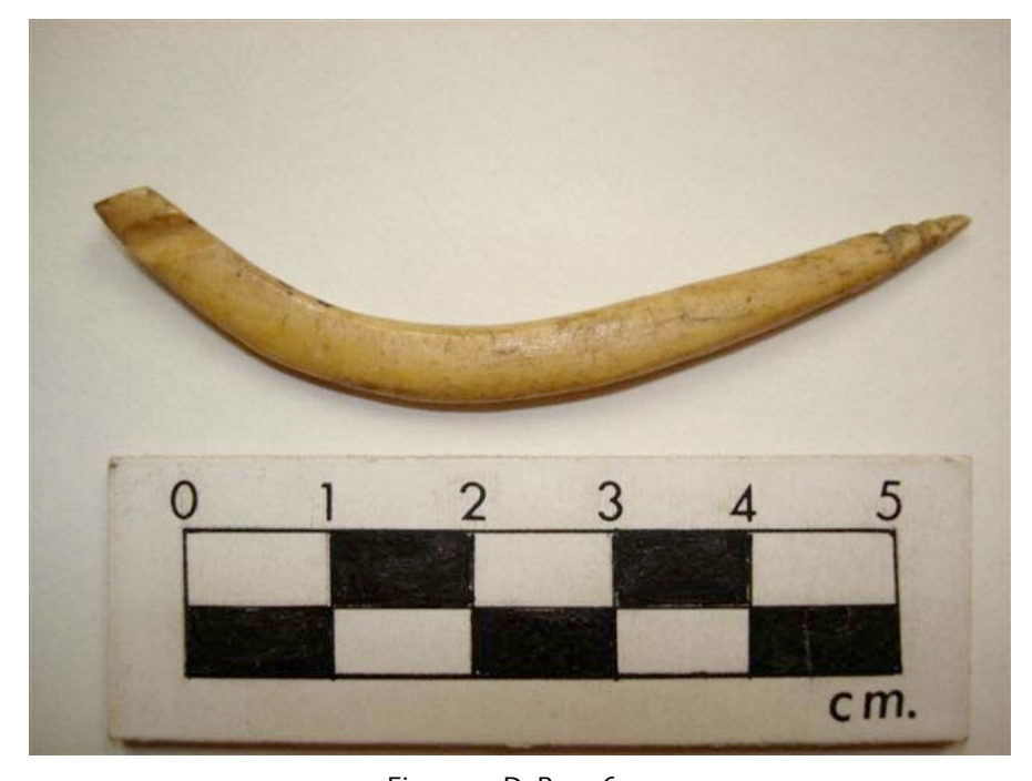
Figure 9. DcRu-116:57

• DcRu-116:57. Bone. Weight: 1.93 grams. Complete. Max. L. 60mm. Mid shaft W. 3.5mm; H. 5.3mm. No true platform. Groove across side of upward curving shaft. 2mm Groove, 3mm from end. Distal end has three different sized grooves extending from one side onto the top to a distance of 8mm from the end. Date: after 1600 B.P.