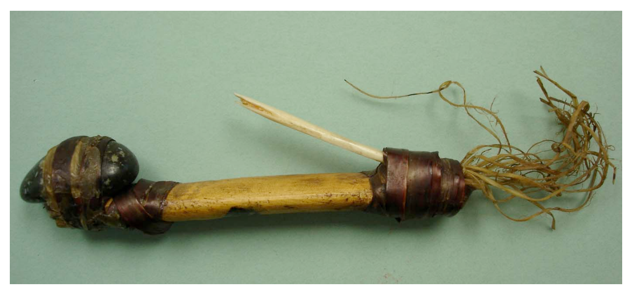
Figure 2. Model trolling hook made in Victoria in 1898. RBCM, Ethnology collection #728.

centres that are exposed if someone attempts to make a sharp point – as is the case with this one. This specimen, shown in figure 2, has a wooden shank that is 115mm long with a maximum width of 17.8mm and height of 9.3mm at the mid shaft. The distal and proximal ends are about 12mm by 7mm under the wild cherry bark wrapping. The natural metamorphic beach pebble (32.6mm X 18mm) on the proximal end is tied on by a white commercial twin or wool, which is then covered by the cherry bark, and the whole end coated in either tree sap or commercial glue. The stone weight is naturally flattened on the bottom, rounded on the sides, and wedge shaped toward the proximal end. The stone weight overlaps the wood shank by 9mm. The bone barb is 69mm long and widest (5.4mm) and highest (2.4mm) where the mid shaft meets the bark tie material. The steamers extending out from the proximal end are plant fibres – possibly stinging nettle fibres. These streamers would function to make the hook move through the water like a squid. The whole hook weights 24.37 grams.