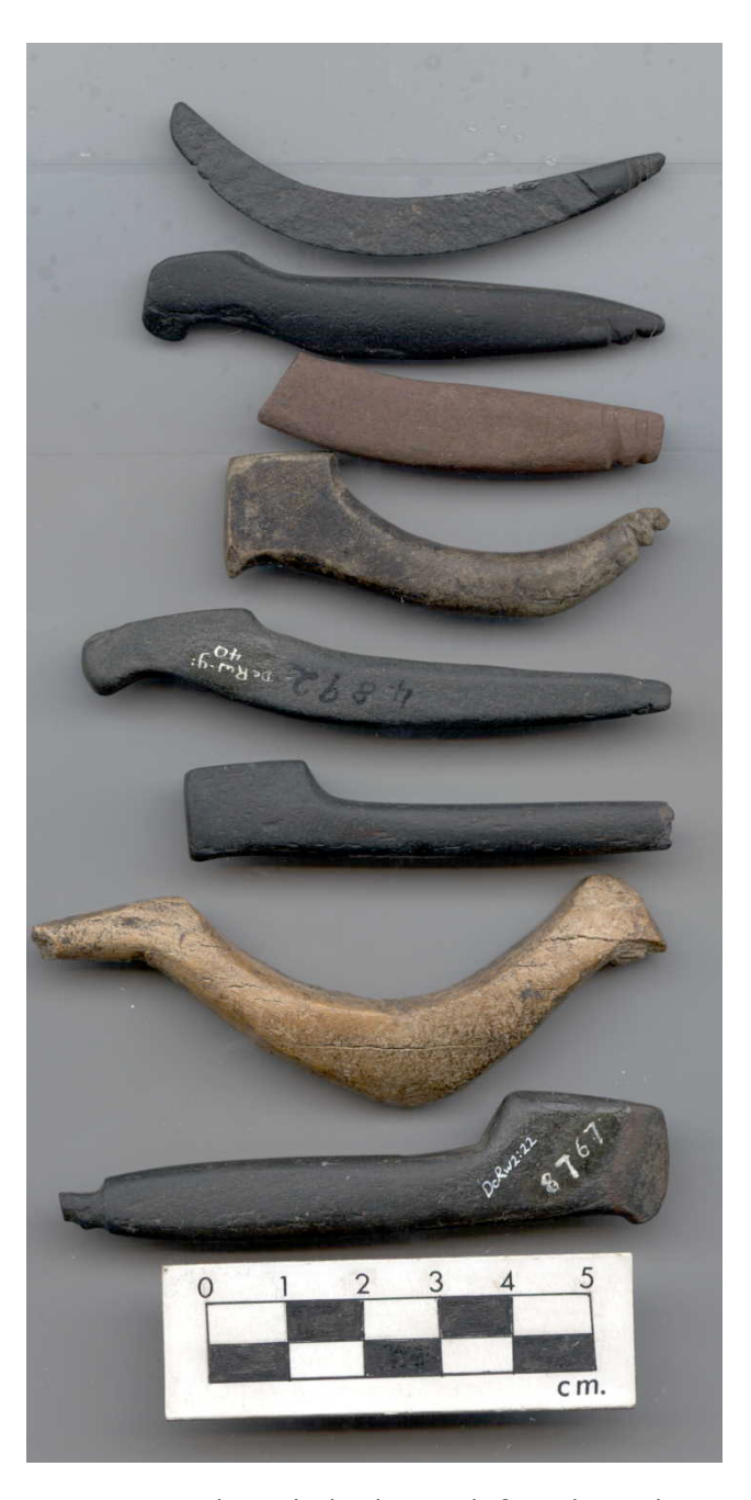
Figure 6. Fish Hook Shanks mostly from the Sooke and Witty's Lagoon area. Top to bottom: DcRv19:13; DcRv2:67; DcRv2:55; DR-Y:224; DcRw- Y:40; DcRw-Y:1; DcRw2:18; DcRw2:22.