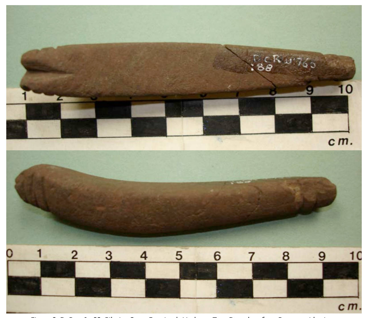
Figure 8. DcRu-760:88. Pilgrim Cove. Esquimalt Harbour. Top: Dorsal surface. Bottom: side view.