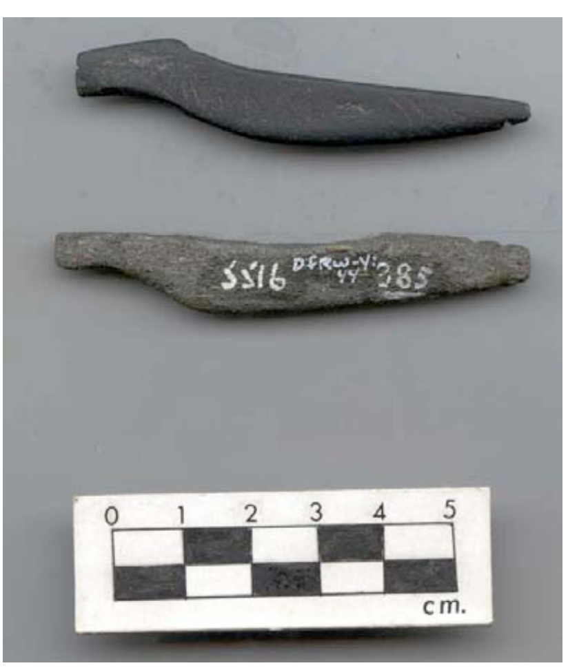
Figure 11. Fish Hook shanks. Top: Duroche area. DhRlm-Y:1840. Bottom: Thetis Island. DfRw-Y:44.

• DhRlm-Y:1840. Stone. 6.68 grams. Max. L. 68mm. Proximal hafting platform: L. 16mm, W. 6mm, H. 10mm, H. distal end 7mm. Ventral platform groove: 12mm Midshaft: W. 5mm, H. 6mm. Proximal end has one cut notch on dorsal surface 44mm