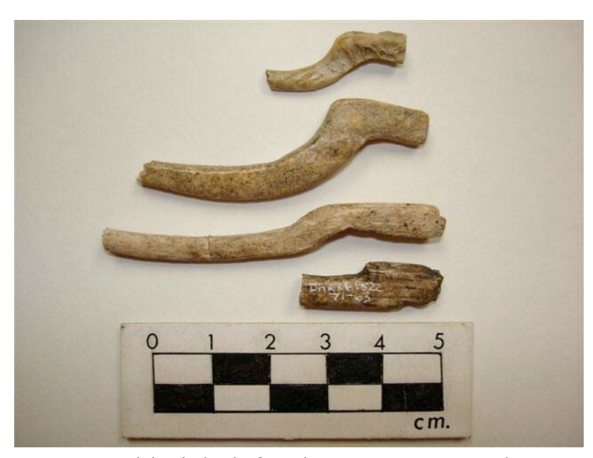
Figure 10. Fish hook shanks from the Nanaimo area. Top to bottom: DgRw- 4:2774; DgRw-4:287; DgRw-4:1199; DhRx-6:522.

• DgRw-4:2774. Bone. (0.64) grams. Proximal end and part of shaft only. Max. L. (25mm); Height of platform 8mm; W. 4mm; L. 11mm. Platform groove width 2mm.