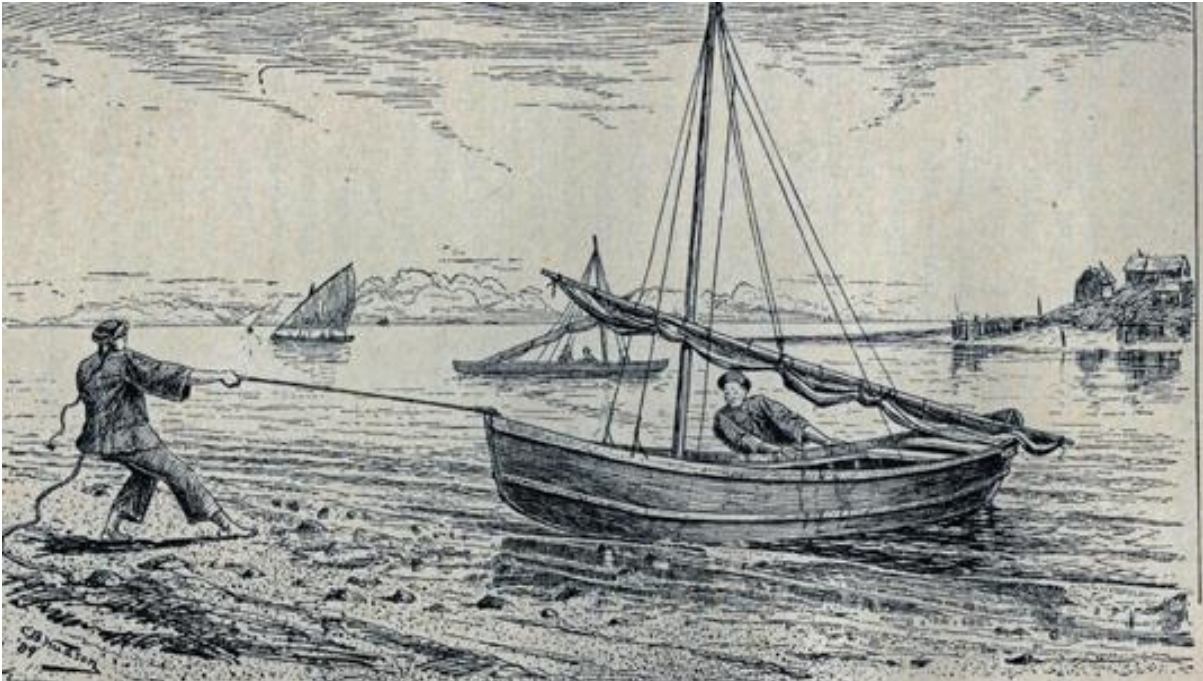
Figure 6. Chinese Shrimp boat, California. (After drawing by Charles B. Hudson, Plate XVI in Collins 1892).

At Port Madison, Washington, a colony of 15 Chinese fishermen: "put up [Pile Surf] perch ( Damalichthys [vacca]) and different species of flounders, mostly Parophrys vetulus [English Sole], Lepidopsetta bilineata [Rock Sole], and Pleuronichthys coenosus [C-O Turbot]. Flounders are valued most highly by the Chinese. The different species of Embiotocidae [Surf Perch] are dried principally for the use of the Chinese working in the mines" (Collins 1892).