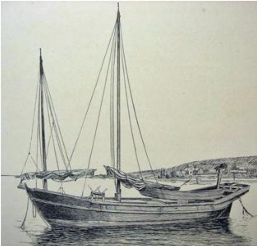
Figure 5. Chinese Junk used by Chinese fisherman off San Diego, California. (After drawing by Charles B. Hudson, Plate XV in Collins 1892).

Fisheries reports indicate: "There is no doubt that the numbers of fishes in San Diego Bay has been greatly reduced by the constant use of fine-meshed seines by the Chinamen". In speaking of Flounder - "Large individuals of this species are now seldom caught, but numbers from 2 to 6 inches long are daily taken and dried by the Chinamen". Smelt [ Hypomesus transpacificus ], mullet [ Mugil cephalus ], herring, roncadores [ Roncador stearsi ], and flounders are taken by means of seines, and in all parts of the bay throughout the years. These fisheries are prosecuted chiefly by the Chinese. All the fish, excepting smelt, mullet, and roncedores (which are sold for home consumption), are salted and exported".