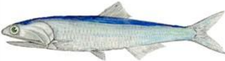
Figure 1. The Northern Anchovy ( Engraulis mordax ) is no longer found in the Victoria inland waterway.

"These fish are esteemed a great luxury by the Chinese in the mines of British Columbia, and it is for their use that they are now being prepared. The process employed in preparing them for market is very simple. They are first passed through a tub of water containing rock salt, and then spread upon mats and laid out in the sun until thoroughly dried, when they are packed in China baskets and shipped to the mines. A very great quantity has been prepared this season."