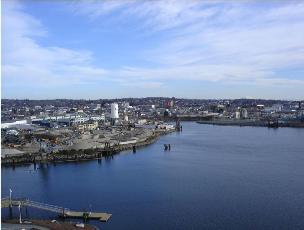
Figure 3. Rock Bay, Victoria, 2009. Grant Keddie.

The same day, The Daily Press reported that: "Yesterday a party of Chinaman caught several cwt of herrings and smelts [Northern Anchovy ( Engraulis mordax )] in James Bay." The next year, on July 1, they report: "with regret that some Italian and Chinese fishermen have been taking trout from the Victoria arm in the neighbourhood of the gorge, by means of drag-nets". The public was encouraged to take action to stop the use of drag nets due to its ruining the trout fly fishing.