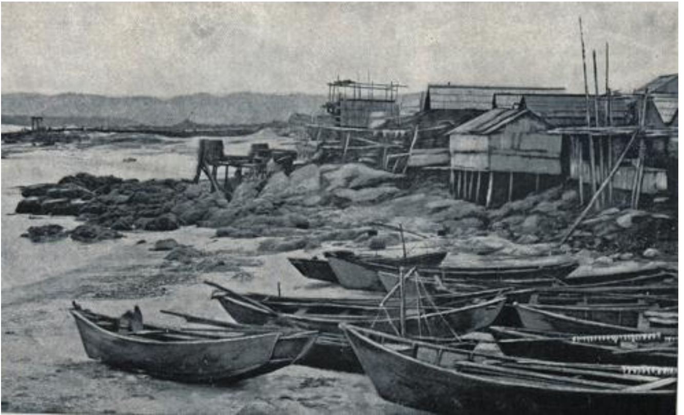
Figure 4. Squid skiffs in Chinese fishing village. Monterey California. (unknown photographer. Plate XVII in Collins).

Chinese immigrants were even more prominent in the fishing industry in California and Washington states where they fished with purse nets for shrimp and small fish to supply the city markets. Fish caught in the San Francisco area were shipped to British Columbia. In the mid 1880s, California fishermen were mostly Chinese, Italian and Portuguese. Catches included shark's fins, crawfish, crabs, shrimps and prawns, abalone and seaweed - which were intended in part for the Chinese immigrant market.