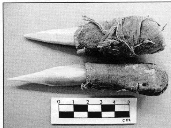
Figure 5. Awls. Top RBCM2448; Bottom RBCM9853.