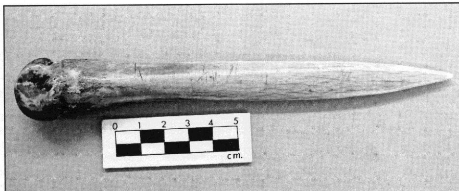
Figure 4. Awl RBCM10876.

described as “basket bone awl” (Figure 1, 13090 only).