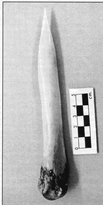
Figure 3. Awl RBCM6374.

The five awls from the region of Coast Salish Speakers include two with their extreme tips missing—13089 (on exhibit, not available for image or measurements) and 13090 (L. 226mm)—that were “purchased from and used by” a woman in Yale and