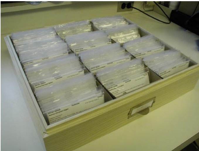
Fig. 3. Drawer from the Odonata collection showing arrangement of unit boxes and envelopes.

computerized data management system and oversaw the initial databasing of the collection. At that time, every specimen received a unique acquisition number and complete data records were produced for butterflies and Odonata. Cris is well known as an author of Butterflies of British Columbia (Guppy and Shepard 2001), a significant book extensively based on RBCM collection data which was published by the museum after he left the RBCM. Among many other contributions, both Blades and Copley aggressively expanded and improved the database; added tens of thousands of specimens to the collection and identified thousands; reordered and relabelled pinning trays, drawers and cabinets; and expanded and relabelled the alcohol collection, converting it to screw-cap vials. David developed the ziplock polyethylene envelope and unit box system to house the Odonata collection (Figures 3 and 4). This replaced older systems that used cellophane or mylar envelopes and smaller unit boxes.