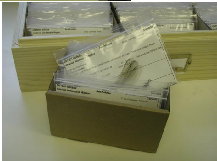
Fig. 4. Unit box and ziplock polyethylene envelopes from the Odonata collection. The specimen data are printed directly from the database.