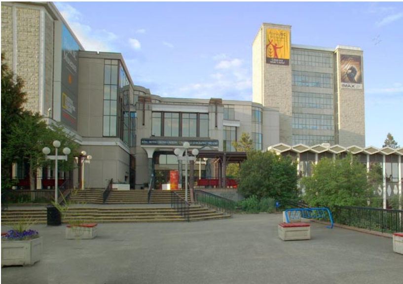
Fig. 1. The Royal British Columbia Museum, Victoria, BC. The entomological collection is housed in the Fannin Building, the tall structure on the right.

The Royal British Columbia Museum sits on an impressive site on Belleville Street adjacent to the Inner Harbour and the Legislative Buildings in downtown Victoria, British Columbia (Figure 1). The Entomology collection occupies most of the sixth floor of the Fannin Building in the museum complex.