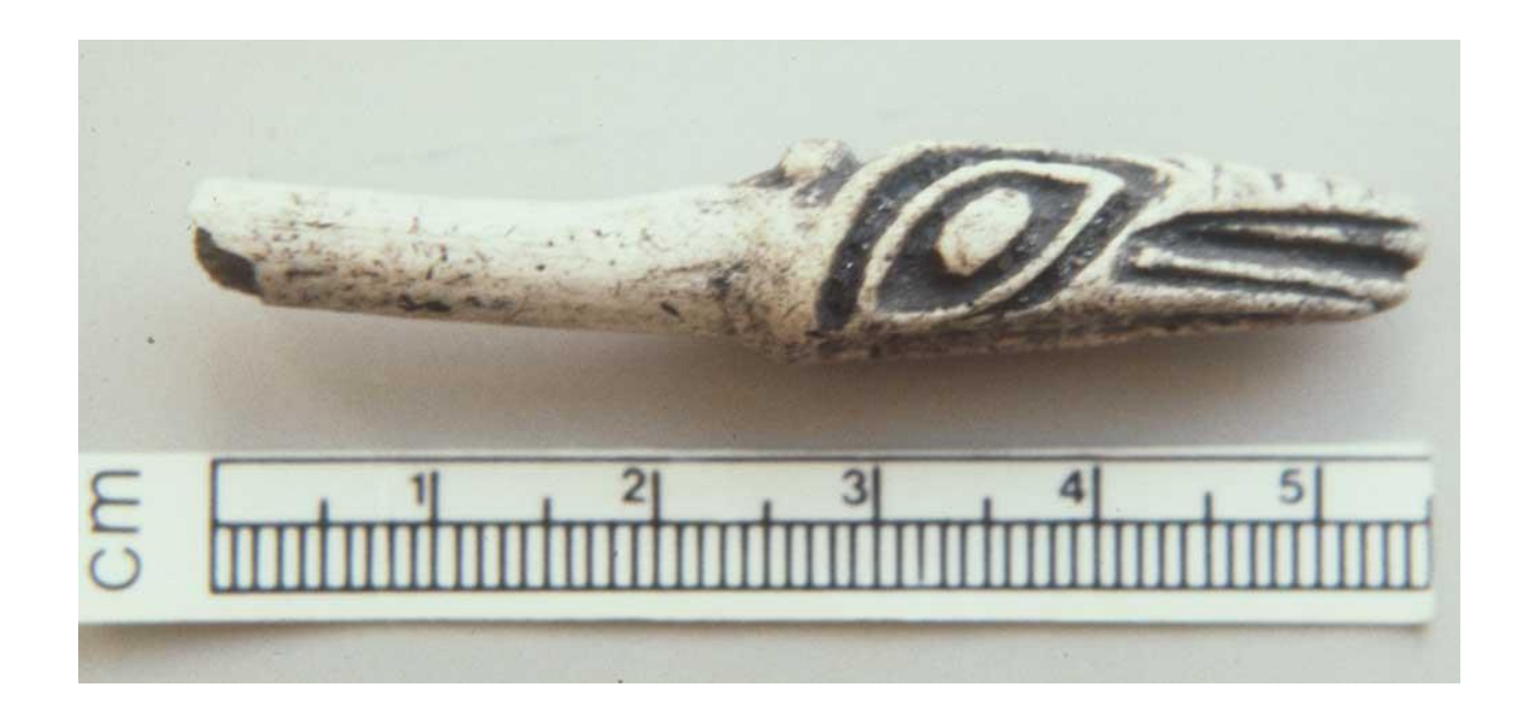
Figure 3. Part of carved bone blanket pin (Victoria site DcRu 75) that may have held a dog hair blanket in place.