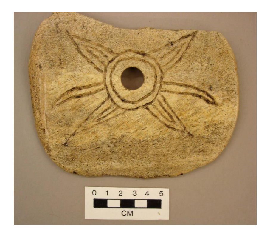
Figure 4. Whale Bone Spindle Whorl from Cadboro Bay, near Victoria.

The Quinault and Skokomish also mixed duck feathers and seed fluff to make blankets. Ethnobotanist Nancy Turner and ethnohistorian Randy Bouchard have recorded that the seed fluff of the Fireweed (Epilobium angustifolium) was mixed with dog hair by the Saanich, and with both dog and goat wool by the Squamish and most Puget Sound groups.