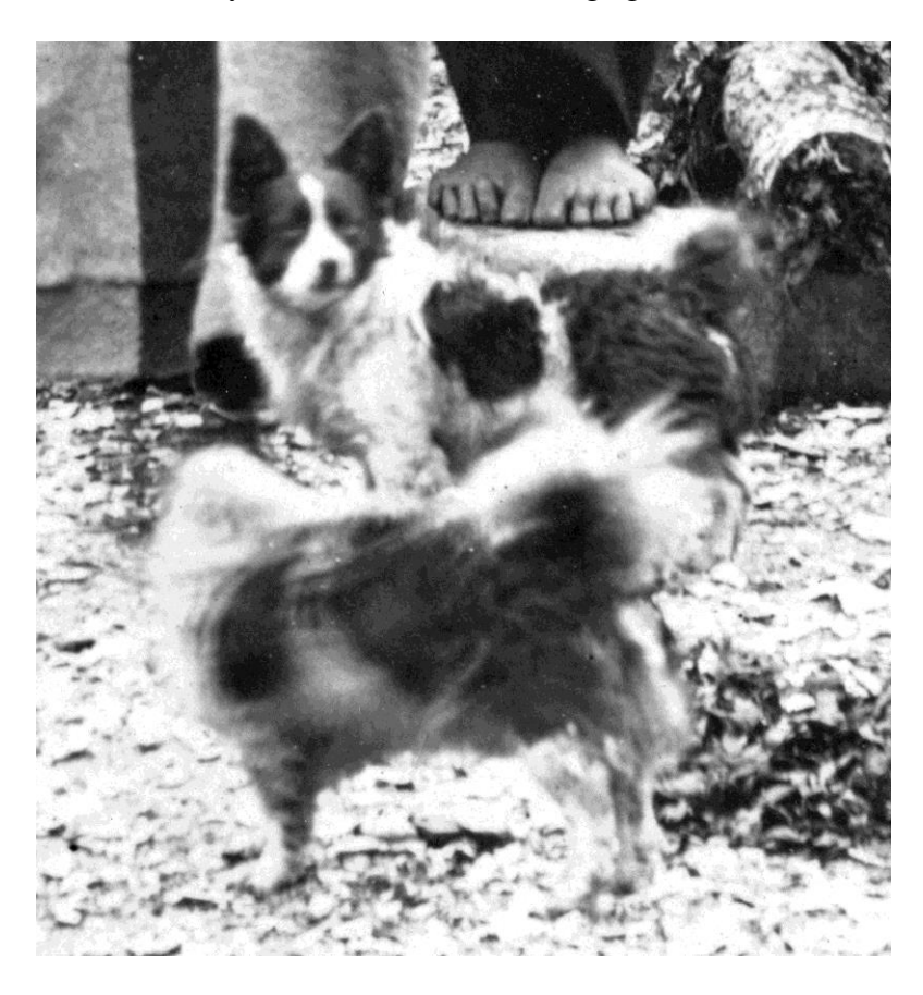
Figure 1. These dogs seen in 1873 at the Village of Quasela in Smiths Inlet closely resemble the descriptions of Wool Dogs. They also, however, strongly resemble the Papillion breed, which was popular in Spain in the 18th century and were probably traded to B.C. natives by the Spaniards. The Papillon, possibly like the Wool Dog, is a mixture of a northern spitz and a southern variety of dog.

With the use of their hair to make of blankets and capes high in trade value, these dogs made an important contribution to the status of their owners. The origin of the dog is particularly interesting. Where did they come from, and how long ago?