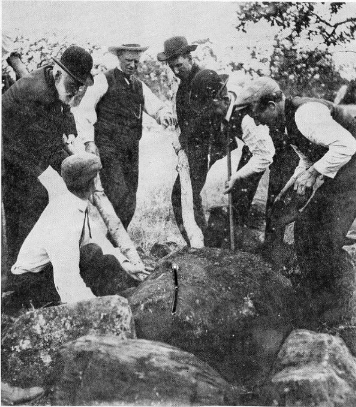
Members of the Natural History Society of British Columbia removing the large central stone from a burial cairn in the Uplands west of Cadboro Bay, on June 1, 1907.