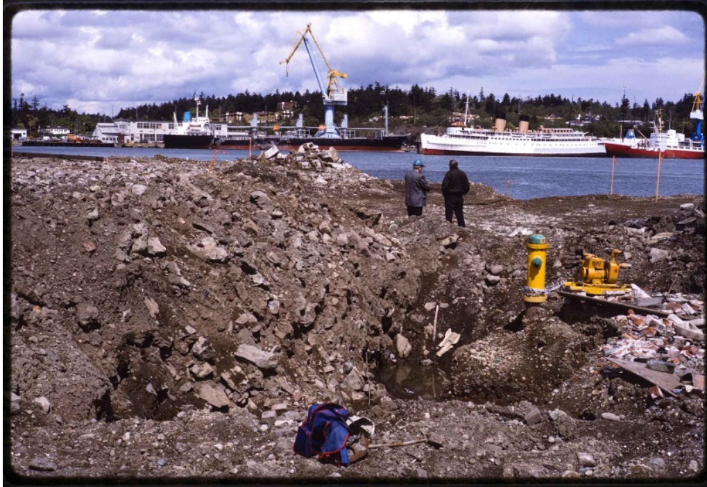
Figure 10. Ernie Colwood with construction foreman at location of mostly destroyed Herring Fishing camp. Looking N.N.E.