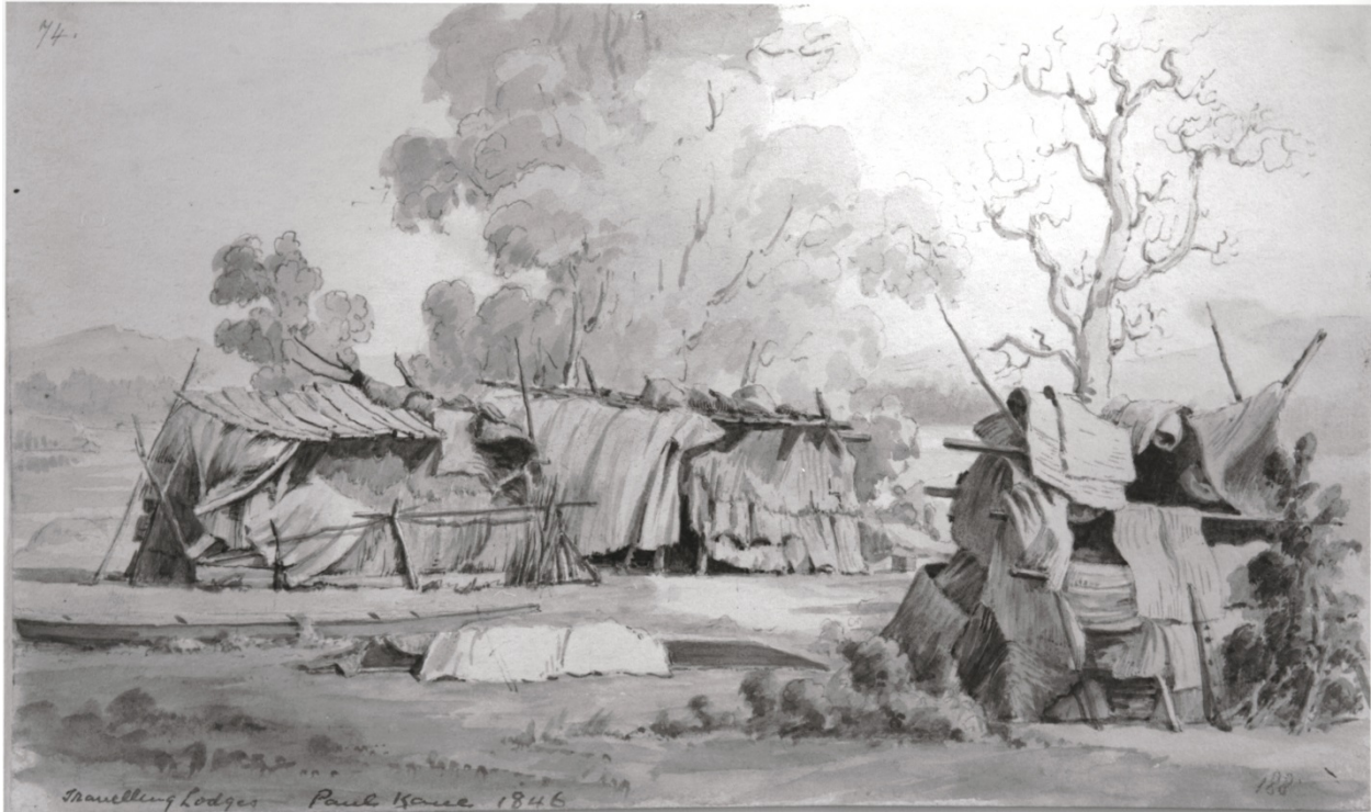
Figure 8. Tuli mat temporary lodges. An early 1900, Black and white photograph (private collection) of a Paul Kane painting that was produced during Kane's visit to the Victoria region between April 8 th and June 9 th , 1847. The original colour painting is now in the Stark Museum of Art, Orange Texas (cat. 31.78.4).