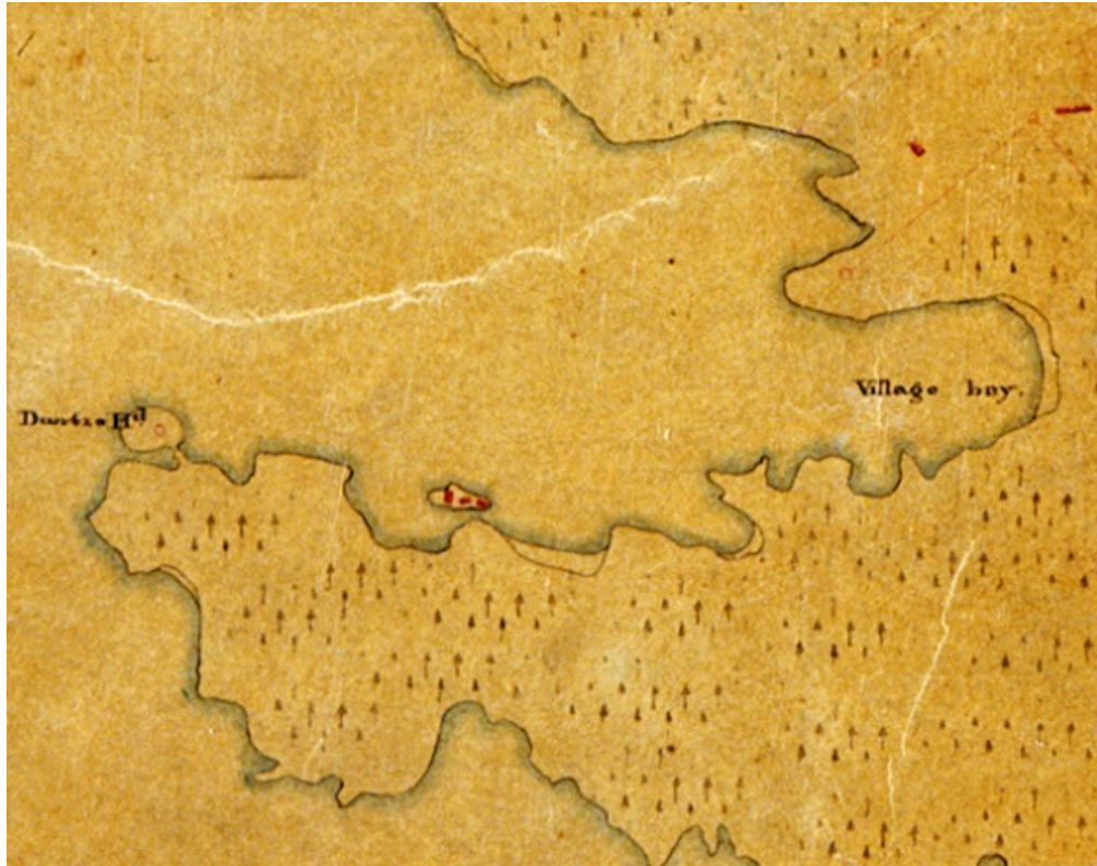
Figure 7. The name Village Bay is shown here in what later became Lang Cove. Small Portion of Hudson’s Bay Company Archives map T16019 entitled: Peninsula Occupied by the Puget Sound Company. The red marks are naval storage buildings on Thetis Island. Observations on Photograph Content

Photograph PN905 shows herring fish on wooden drying racks to the left side of the image. A First Nations man, in European style clothes, is standing in front of a tuli (bulrush) mat summer lodge which is located on a built-in flat platform area faced with a board in front. This is the left of the two board faced platforms that can be seen in photograph F-08522. This is an interesting example of the human modification of a shell midden.