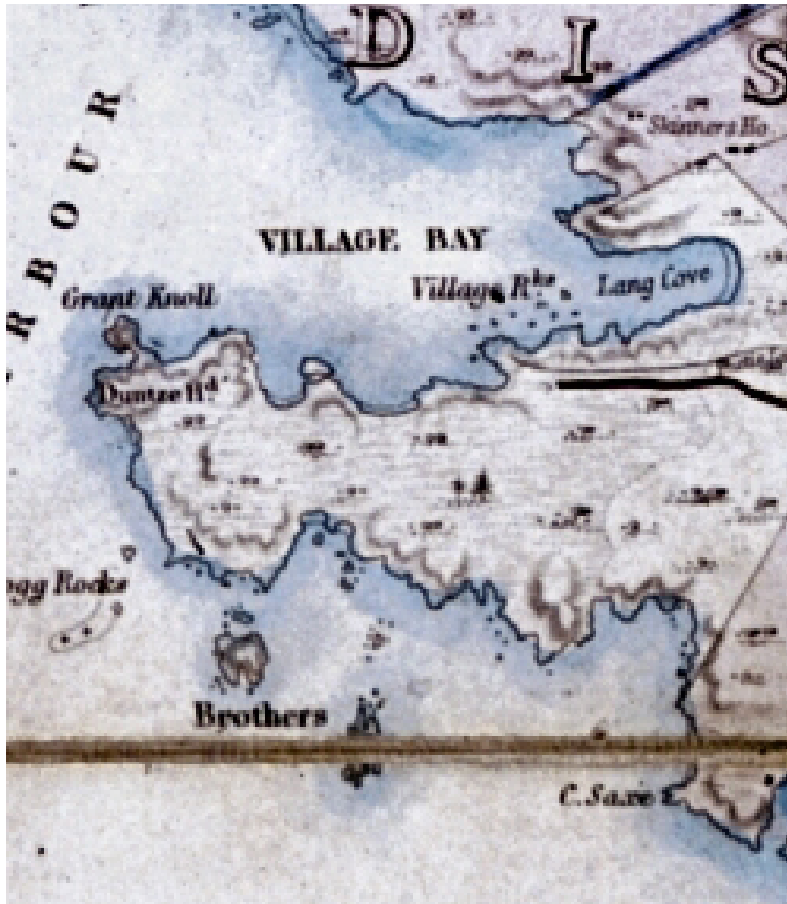
Figure 6. Small Portion of 1854 “District of Victoria and Esquimalt, Vancouver Island” showing Village Bay at the same location later referred to as Constance Cove. Village Rocks is noted and remains on later maps (Canadian national Archives g.3/96 (N9301).

The names of some of the bays and coves changed over time. Several maps produced from 1851 to 1855 show “Village Bay” in Lang Cove or where later maps show Constance Cove.