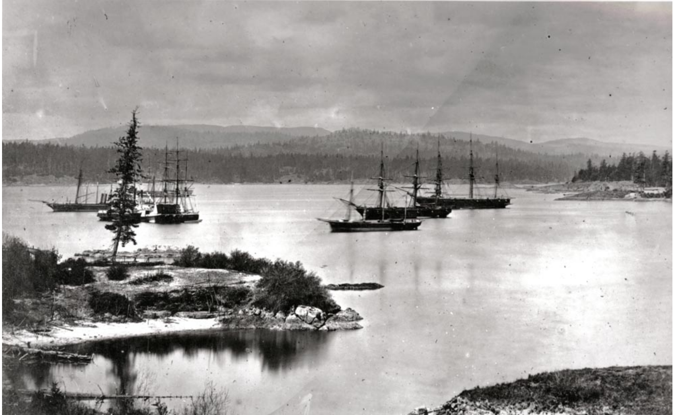
Figure 3. This photograph taken in 1867, by Frederick Dally shows the herring fishing camp in left foreground (RBCM F-08522).

photograph PN905, suggesting the time separation of a year or less is most probable.