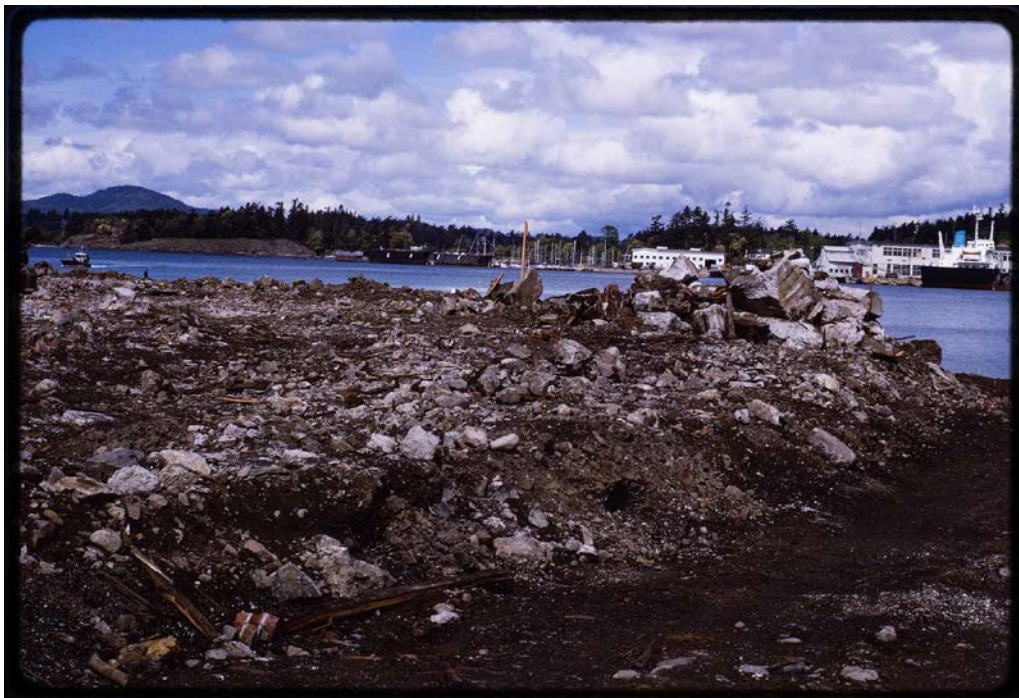
Figure 11. Area of buried shellmidden. Looking North.