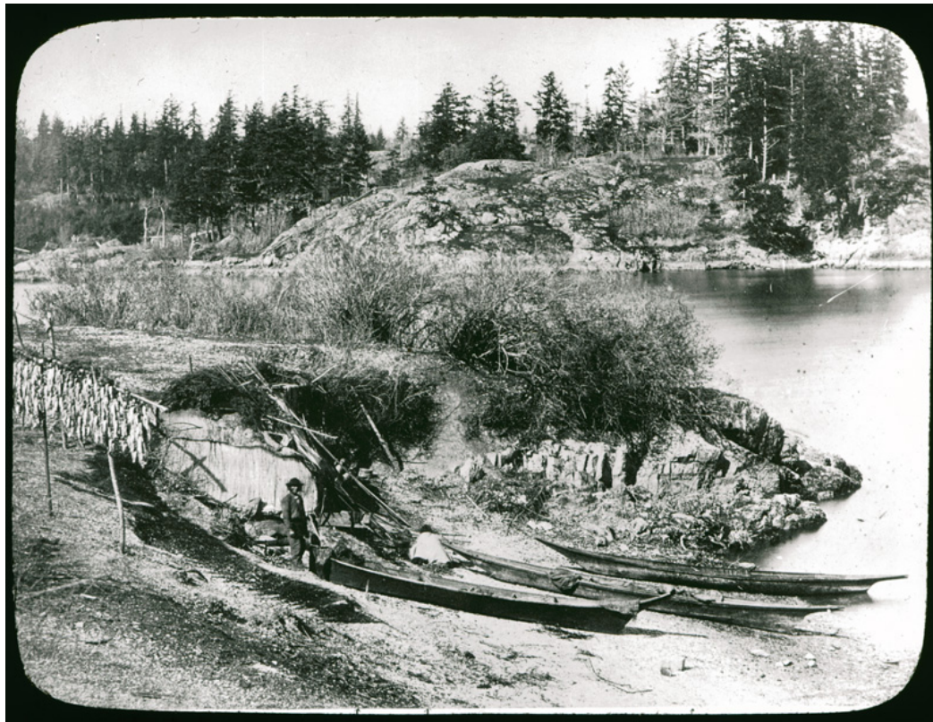
Figure 1. Herring Fishing Station at Wood’s Landing in Esquimalt Harbour. RBCM PN905.

19 th century photographic images in the Victoria region that show Lekwungen (Esquimalt and Songhees First Nations) undertaking traditional food gathering practices are rare. The only example of fishing is a photograph, taken in 1868, by Frederick Dally in Esquimalt harbour at the south entrance to Lang Cove (RBCM PN905). Lang Cove is located south of Skinner’s Cove, both of which are within the larger Constance Cove. This is the location of an ancient shell midden as demonstrated by the scattered white clam shells seen in the image and later observed by the author at this location.