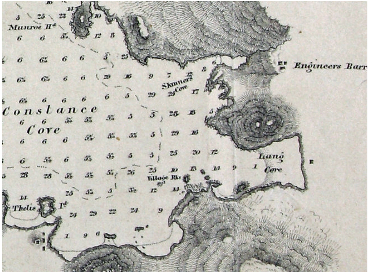
Figure 5. Map showing the small hook of land at Wood's Landing and Village Rocks. H.M.S. Plumper survey of 1859. Note the larger area called Constance Cove.