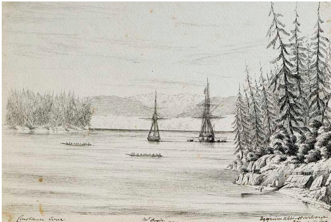
Figure 12. Drawing by John Palmer Linton in 1851. Constance Cove. Esquimalt Harbour, Vancouver Island. Royal Geographical Society.

In 1851, naval surgeon John Palmer Linton, while visiting on board the HMS Portland, drew a view from the back of Lang Cove (Driver 2013; Driver and Jones 2009). In this image (Figure 12) we can observe, on the far right, a tuli mat shelter with fish drying racks like that in figure 1. This fits the general descriptions of the time about temporary shelters around the edges of Esquimalt Harbour, but no specific mention of this location is in Linton's writings. We cannot be certain that this imagery was not simply added to enhance the drawing as was a common practice at the time. The added-in drawing of First Nations in canoes near European ships was a common practice among artists.