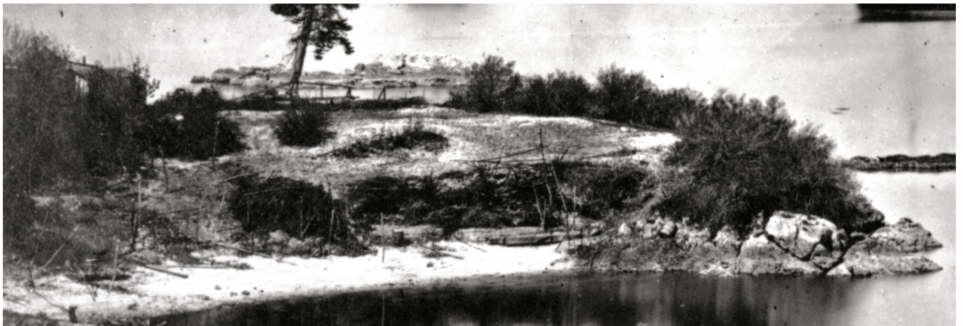
Figure 4. Close-up of photograph (RBCM F-08522) showing the same fishing camp area as seen in figures 1 and 2.