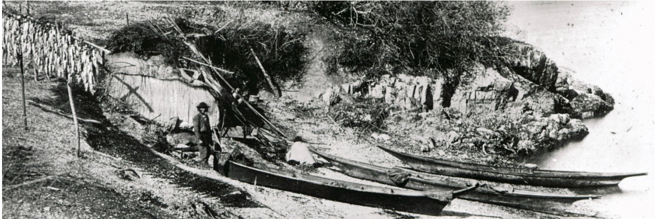
Figure 2. Close-up of Herring fishing camp (RBCM PN905).

A copy of this photograph was also in the original photo album of Lieutenant J.C. Eastcott, the surgeon on the ship H.M.S. Reindeer that was on duty at the Esquimalt Royal Naval Dockyard station from 1868-75 (now the Canadian Forces Base Esquimalt).