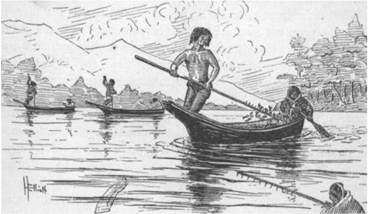
Figure 13. This drawing shows the use of the herring rake by Tlingit people near the mouth of the Stikine River in the 1880s (From Elliott 1886:57).

lighting their lodges". The 6 to 8-foot herring rakes had barbs "usually" of bone but "preferably" of nails. They sometimes catch two to three herring on each tooth. (Dally 1865).