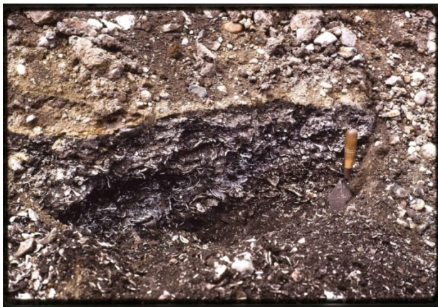
Figure 9. Buried dense concentrations of Shellmidden.

In the 1980s, Ernie Colwood of CFB Esquimalt took me to the Wood's Landing location during construction activities. Here I observed tons of historic debris from previous projects on top of and mixed in with shellmidden.